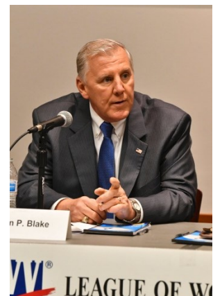
22nd State Senate Debate