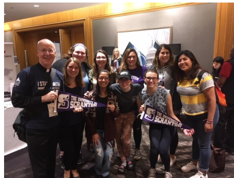
Recent Alumni attend some of the best Graduate & Law Schools