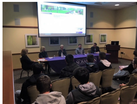
Nonprofit Alumni Panel