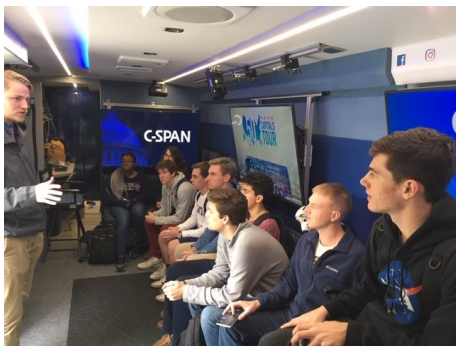
Students explore C-SPAN