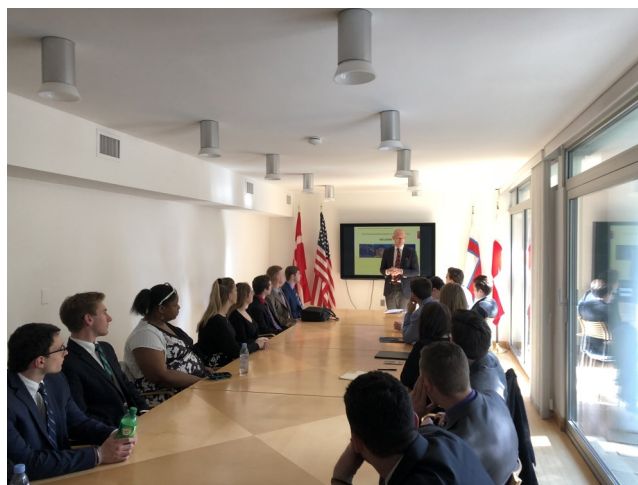
Briefing at the Danish Embassy in DC.