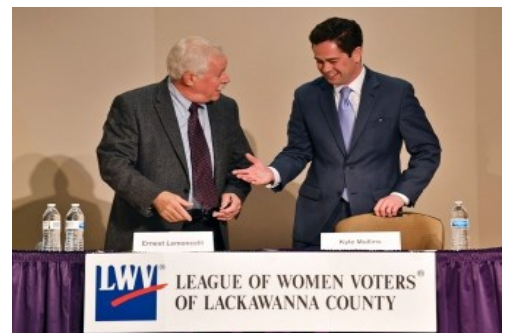
112th State House Debate