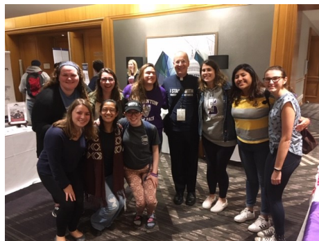
Hanging with Fr. Jim Martin at IFTJ