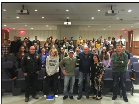
9/11 first responders