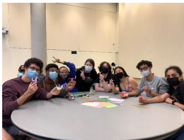
Students show their origami masterpieces during September's workshop.

Right, some of the origami pieces created by students